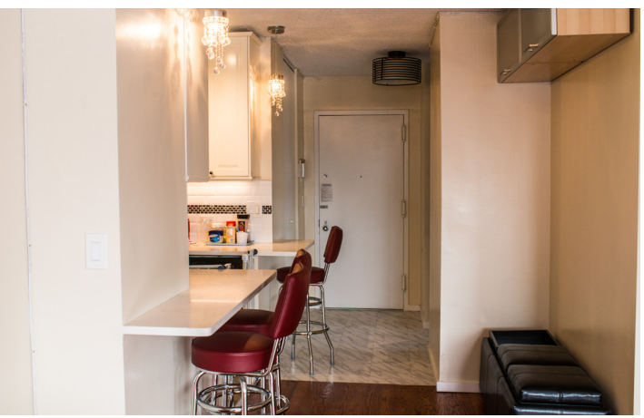
2 BEDROOM | 1 BATH | BUILT 1988 | $3,891.92 TAX | CONDO